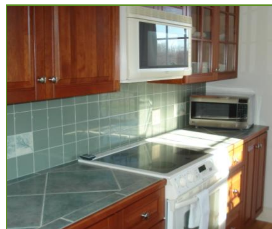
The kitchen enjoys great sunlight from its two windows and convenient access from the garage and breeze way.