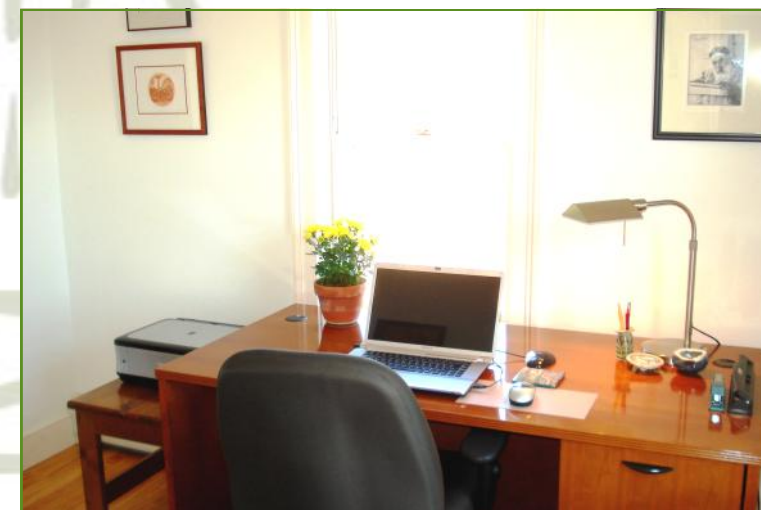
Overlooking the front lawn, this space is currently used for an office, but would be equally adaptable for a study, nursery, or den.