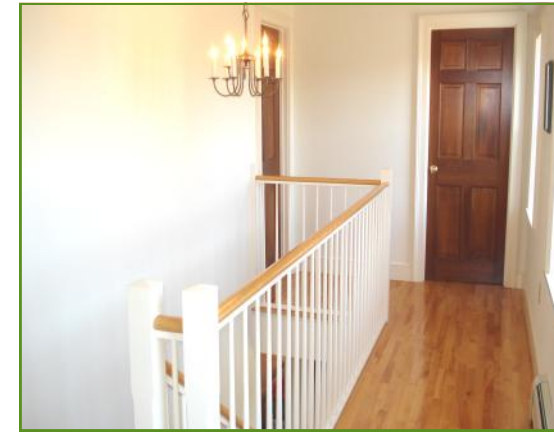
The stairs from downstairs lead to a "cat-walk" which provide access to the bedrooms and office.