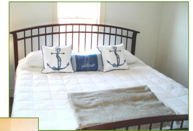
The master suite caters to the owner with a 16 jet therapeutic tub, morning kitchen with refrigerator, bar sink, and cupboard as well as a magnificent walk-in closet with 10 drawers, 28 shelves, and 2 cabinets all finished in beautiful maple.