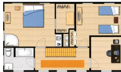
Floor plans are not to scale and are for illustrative purposes only.