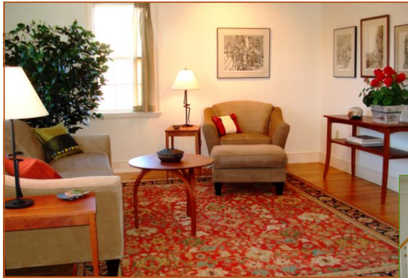
Flame birch floors, custom molding , a wood burning fireplace, ceiling lighting and understated sophistication are hallmarks of the living area.