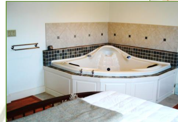
The tub in the master is by Aquatic.