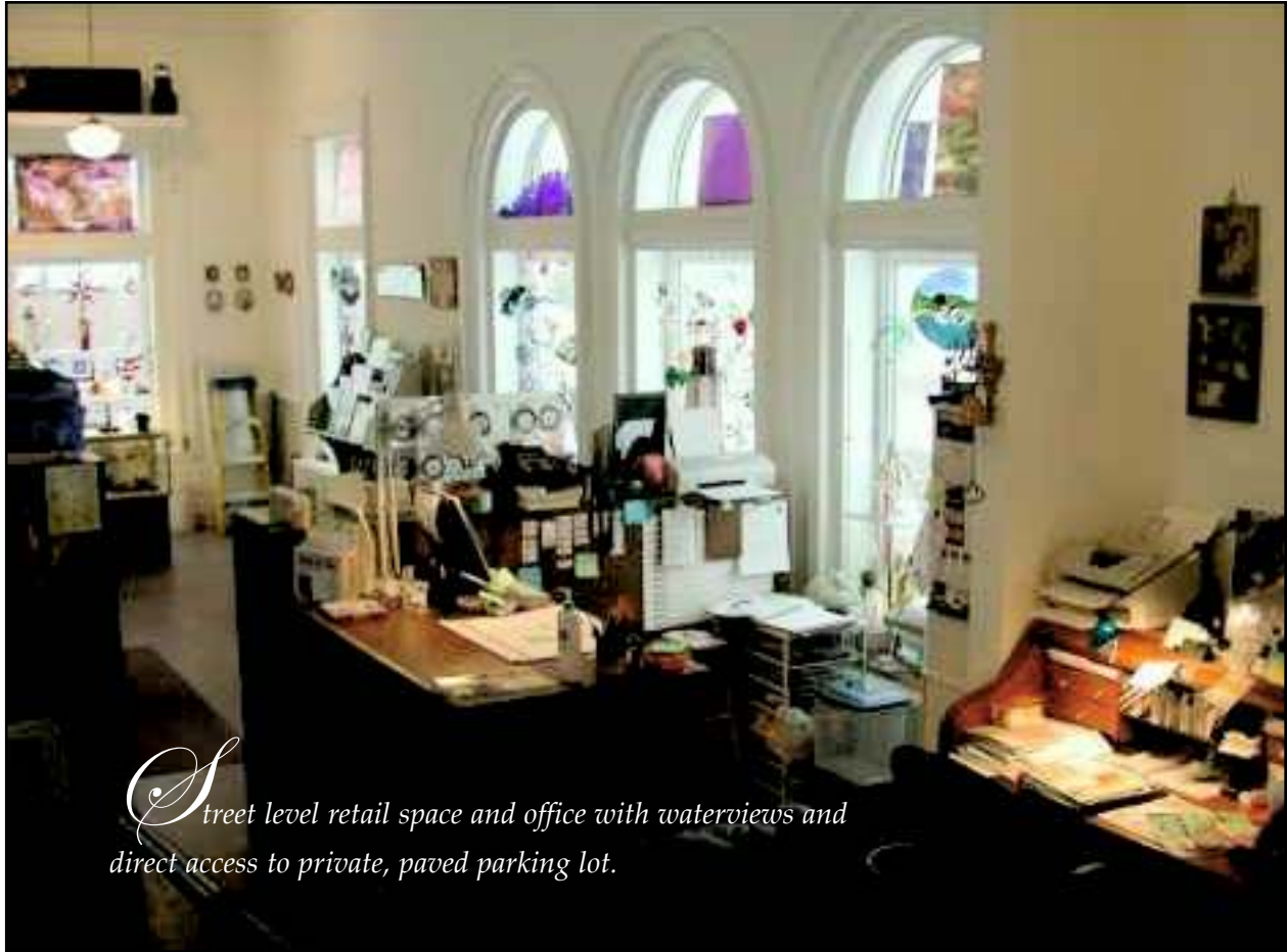
Street level retail space and office with waterviews and direct access to private, paved parking lot.