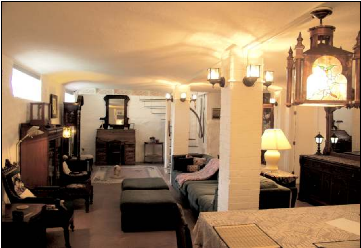
Lower level daylit luxury apartment offers central air and radiant heat.