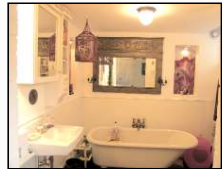
Master bedroom with private bath