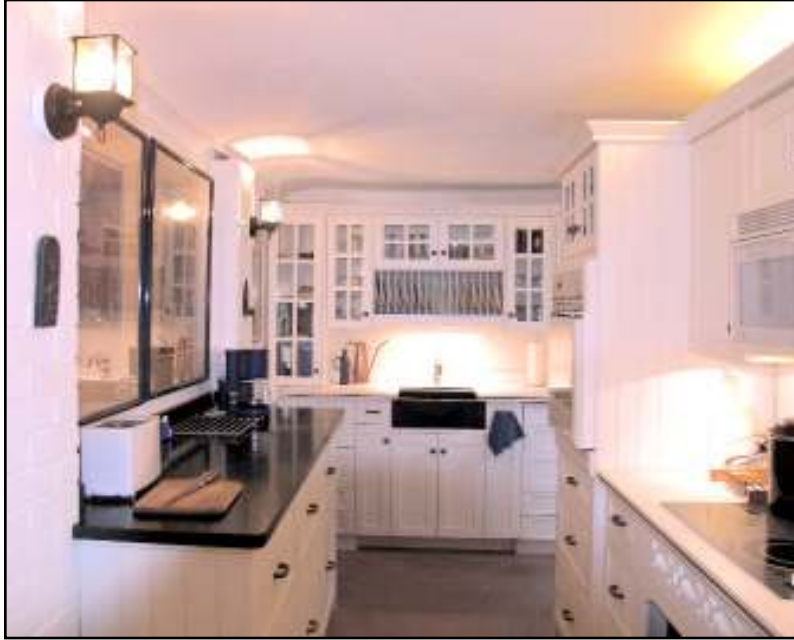
Chef's kitchen with breakfast nook includes black granite countertops, custom cabinets, Sub Zero refrigerator and two convection ovens.