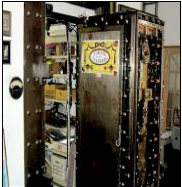
Working 8' x 9' Bank Vault.