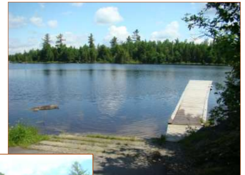
The property is just a short boat ride from the private community dock.