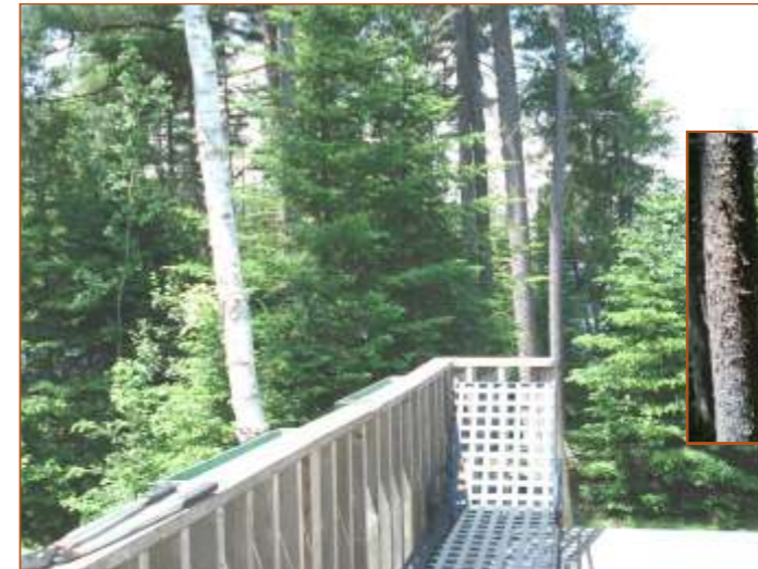
The side deck enjoys great views.