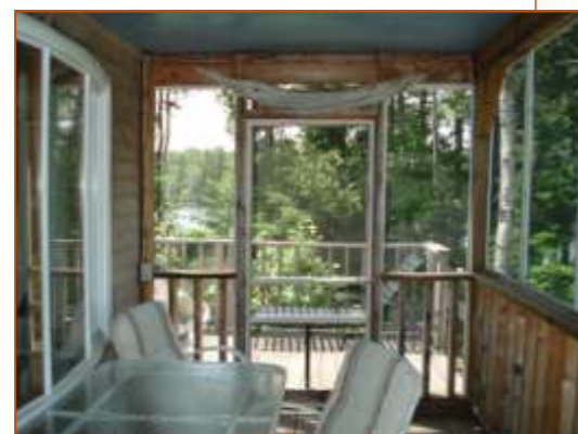
A screen porch runs the entire width of the camp.