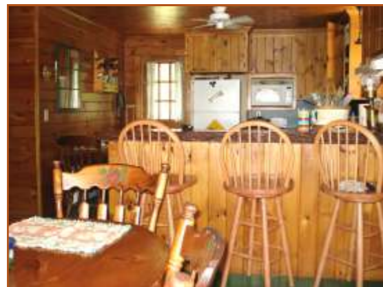
The kitchen is full featured with breakfast bar and eat-in dining area.