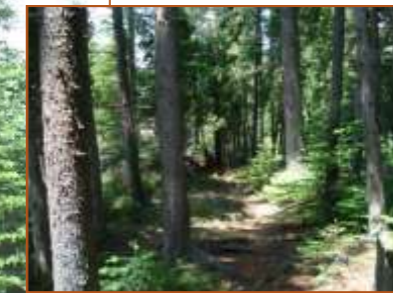
The 3 acre parcel features beautiful woods and a trail at the lake's edge.