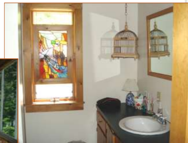
The property features a 3/4 and 1/2 bath.