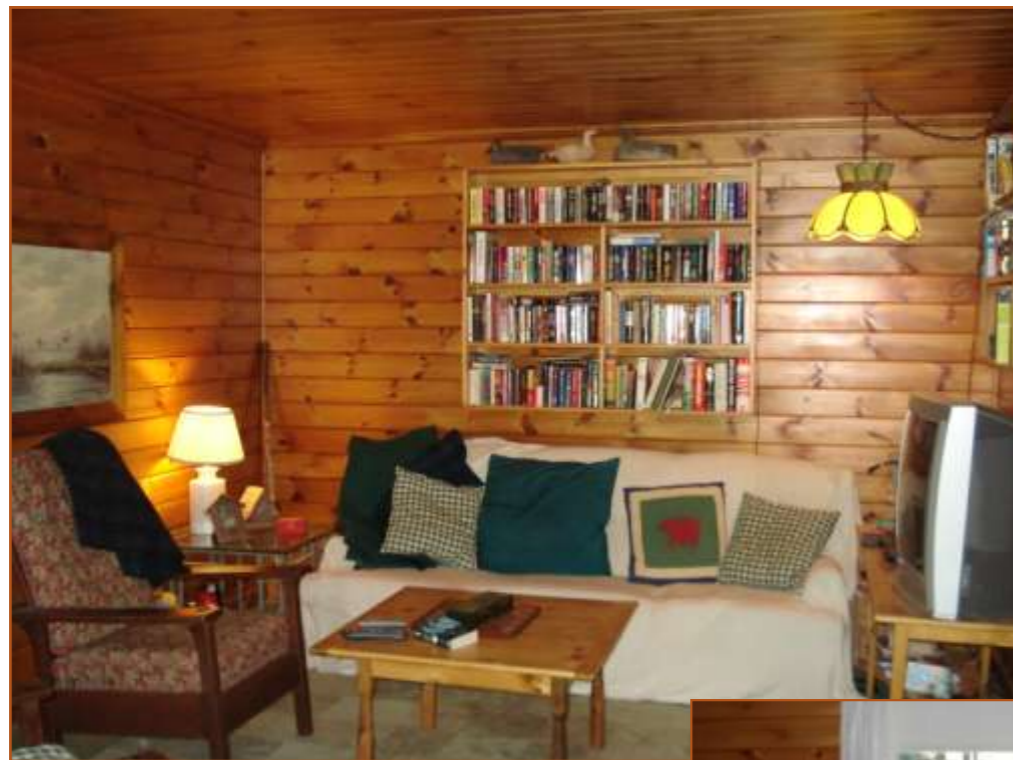
The entire cabin is finished with warm pine paneling.