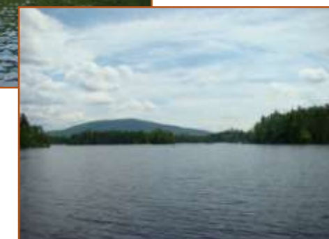
The region is know for is beautiful shores, magnificent mountains, abundant wildlife and 45,000 acres of water.