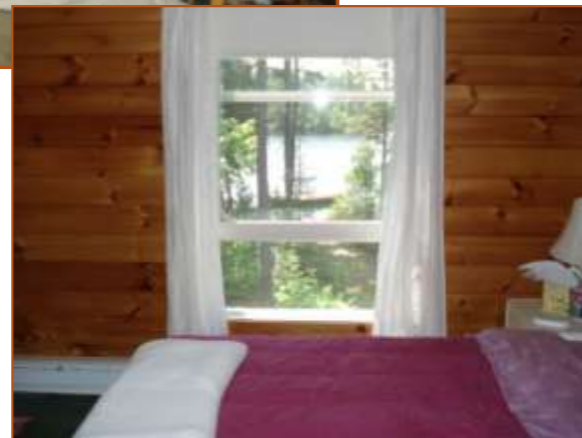
The four spacious bedrooms provide vistas to the woods and lake below.