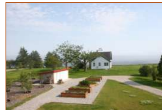
View of the garden from the studio balcony.