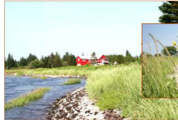
The vistas from the grounds are ever changing.

The open and spacious vaulted studio features giant windows and skylights and the finest quality woods and finishes.