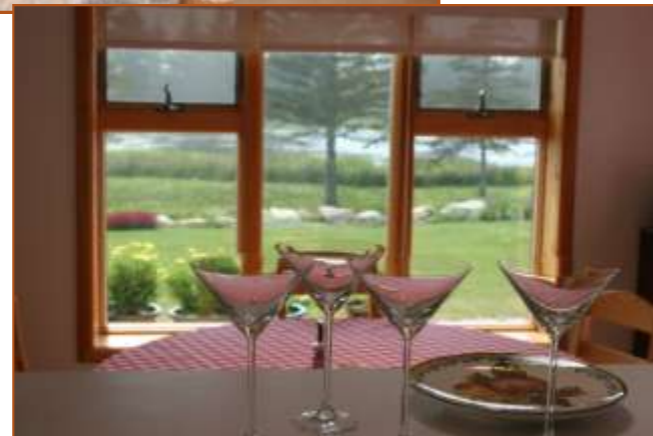
The dining area overlooks the pond.