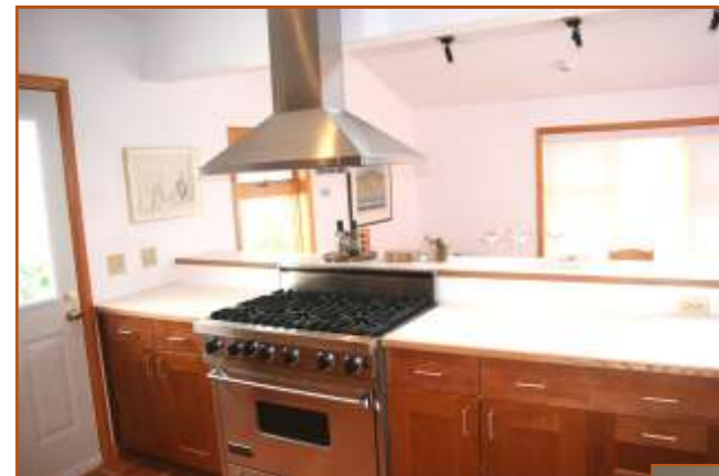
The downstairs gourmet kitchen offers professional appliances and adjoins the greenhouse; from garden to table in two steps.

The expansive shore frontage, includes white pebble sand beaches as well as rocky shorelines.