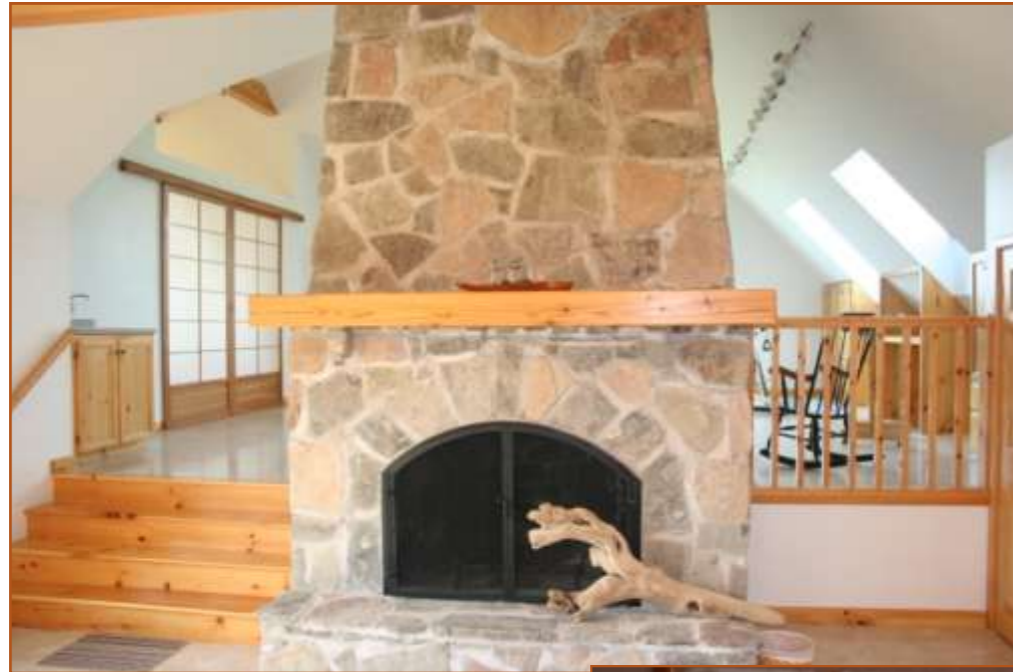
The massive stone fireplace.

The open and spacious vaulted studio features giant windows and skylights and the finest quality woods and finishes.