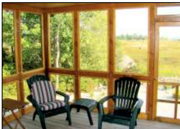
Master bedroom suite with private screened porch facing east to catch the sunrise